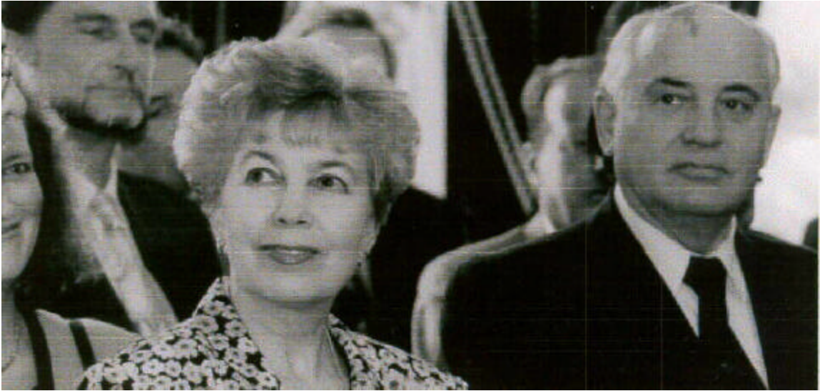
• Raisa Gorbacheva (d. 9/20/1999) and Mikhail Gorbachev. Gorbachev is Honorary Chairman of the International Board of Advisers to “Children of Russia”